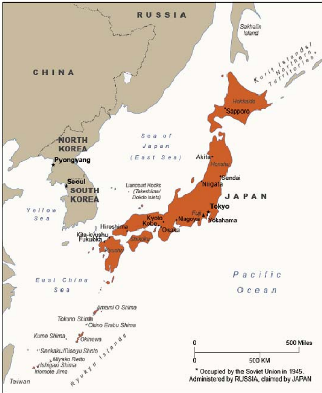
Figure I. Map of Japan